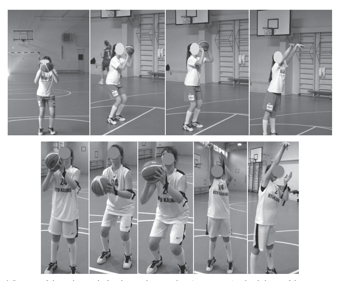
Figure 1. Sequence of photos showing the free throw technique without (upper images) and with the use of shooting straps (lower images).

coordinated to perform free throws with his/her mind clear of pressure and external information (Amberry, 1996). The result of the test was quantified as the number of successful shots expressed as a percentage of all the shots attempted. The exact same procedure was repeated after the intervention training in order to test the short-term effect of a shooting strap (after one month of practice). The retention of the shooting skill was tested one year after the intervention (long-term effect). In the test training sessions the players performed the same routine with warm-up activities and the free throws test (25 minutes). Afterwards, they continued with their training tasks and drills focused on tactical and technical aspects of the game (60 minutes). The tests were supervised by two expert coaches (observers to gather the data) with clear instructions of no interaction between them and the players. Then, the players received the initial information about how to do the tasks (free throws tests), but no feedback or support (i.e., emotional, performancerelated, social) were given during the tests. The coaches' feedback was only given after the training session. Its focus was on the improvement of free throw effectiveness with the emphasis on its importance during games and competitions (performance perspective), but not on the test performance. No emotional information was offered to the player